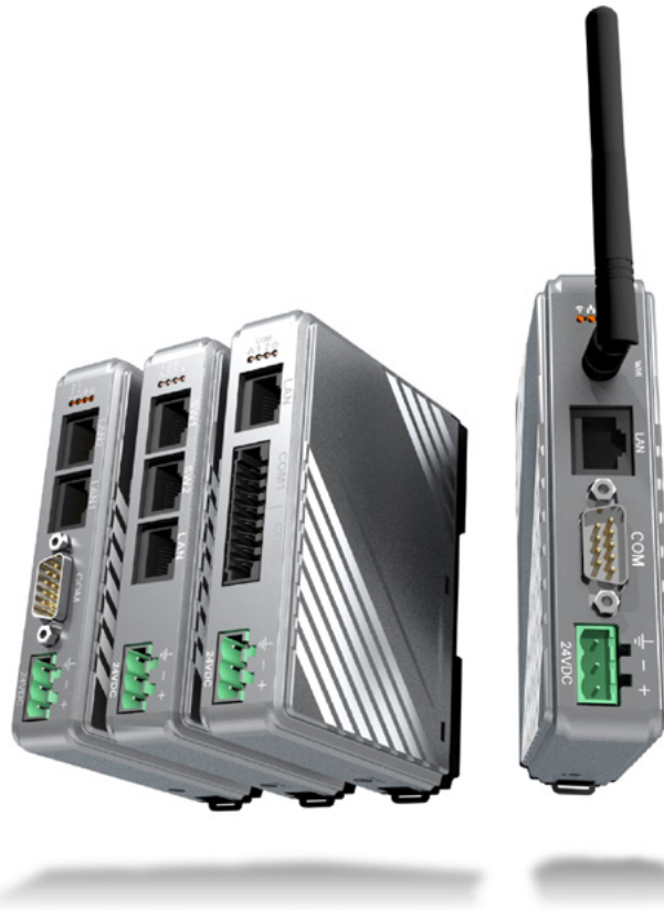
Shown here from left to right are the Weintek cMT-G01 with three serial ports (RS232, RS485-2W and RS485-4W); the cMT-G04 IIoT gateway with Ethernet bridge and built-in Ethernet switch — and SW1 and SW2 to connect to the machine network and a LAN port to connects to the company network; the cMT-G03 gateway; and cMT-G02 IIoT gateway with Wi-Fi connectivity to connects to company network, on Ethernet port (eliminating the need to rewire Ethernet cables); and three serial ports (RS232, RS485-2W and RS485-4W) to connects to three different serial buses at the same time.

The first step in imparting IoT functionality is to get data from existing communication interfaces, most commonly through serial and Ethernet ports. But integrating miscellaneous factory-automation equipment can be challenging, especially where disparate