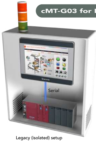
Legacy (isolated) setup

Upgraded IIoT setups employing a Weintek cMT-G03 require no additional serial interface, as the gateway integrates this and other networking subcomponents.