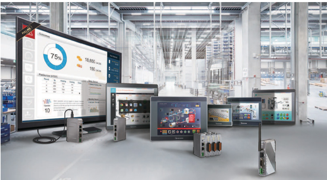
Weintek cMT-G03 and Weintek cMT-G04 gateways are part of the manufacturer's cMT Series that helps users solve industrial control and connectivity challenges. The latter are a cost-effective gateway option for Ethernet-based HMI and PLC functions. A small form factor simplifies integration into existing IT infrastructure and onto various machines.

A third type of hardware for industrial networking called bridges join similar networks (or LANs on one protocol) to serve as data links with an input and an output ... and essentially function as repeaters capable of filtering data.